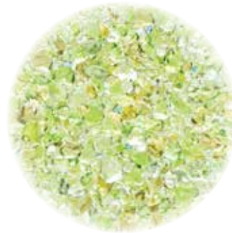
Grade 1 0.5 - 1.0mm (equivalent to Grade 16/30 sand)