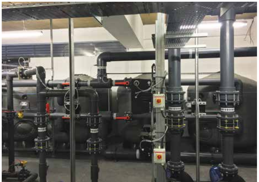
Waterco's Micron SPDD Nozzle Plate filters are made from continuous strands of high quality fibreglass filament wound under controlled tension to create a seamless, impervious filter vessel.

turned to Waterco, which supplied four Micron SPDD2000 Nozzle Plate filters for the main pool and two Micron SPDD1400 for the teaching pool. Waterco's EcoPure Glass Media was used for both filters, while Waterco Dual pressure gauge panels were also installed.