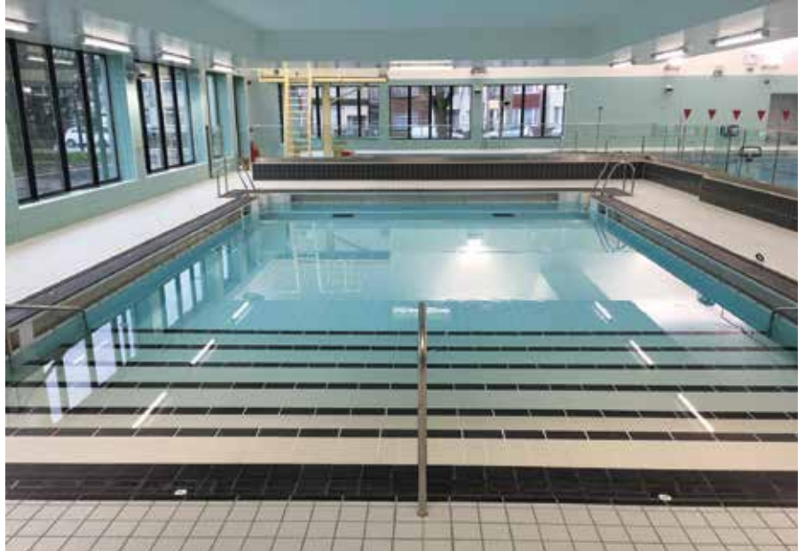
60m 3 fully tiled teaching pool.

Behind the scenes, an equally impressive works project got underway. "The original filters were two horizontal and one vertical metal fabricated sand filters that had started to corrode and were costly to repair, along with the ongoing maintenance program required with metal fabricated filters," Mr Cheek states.