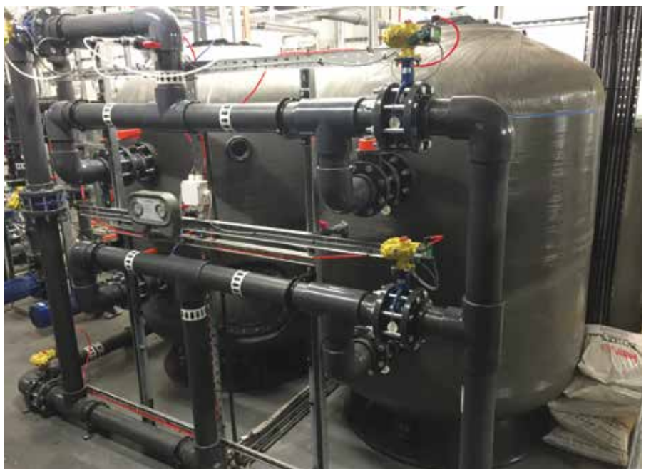
Waterco's Dual Pressure gauge panel extremely versatile pressure measurement and test instrument. It can simultaneously display the output of two pressure gauges, so that you can accurately monitor the filter's pressure drop.

All filters were fitted with the Waterco dual pressure gauge panels to indicate the differential pressure readings across the filter bed for backwashing purposes. The backwash system is fully automatic with a mimic showing the action of all the valve processes for filter, backwash and filter to waste (rinse) facilities.