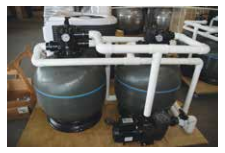
Hydroxypure sanitisation system, two Micron S702 fibreglass filters, a Supatuf 250 pump and an Electroheat heat pump is installed on every pool.