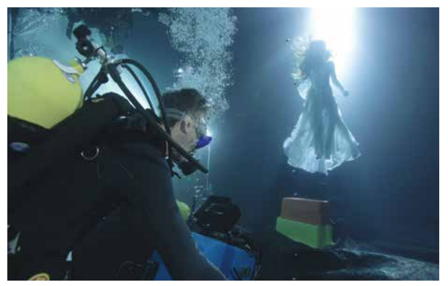
Underwater filming for the Viacom television series, Shannara.

It's so clear, that a new Viacom television series called Shannara, which recently filmed in the underwater tank, described the footage as "cinematic".