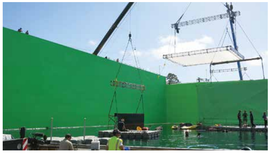
Outdoor dive tank with its multitude of rigging points.

"Along with the comfortable water temperature, easy access and multitude of 'rigging points' available, we are able to get the best shots possible in a very safe and efficient process."