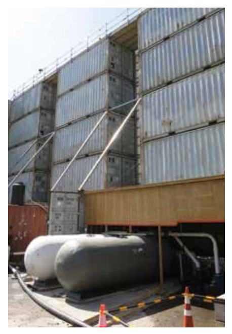
Ocean Surface Tank's external wall and its Micron M5000 horizontal filters.