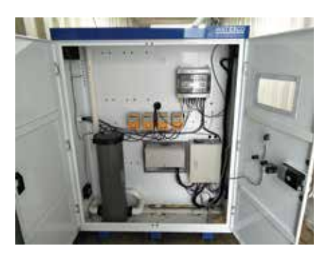
Waterco's Hydroxypure commercial system sanitising the 1.267 million litre Underwater dive tank.