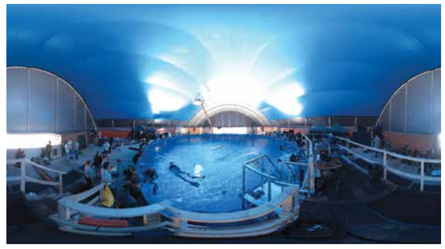
1.267 million litre indoor underwater dive tank. Hydroxypure creates crystal-clear, chlorine-free water.