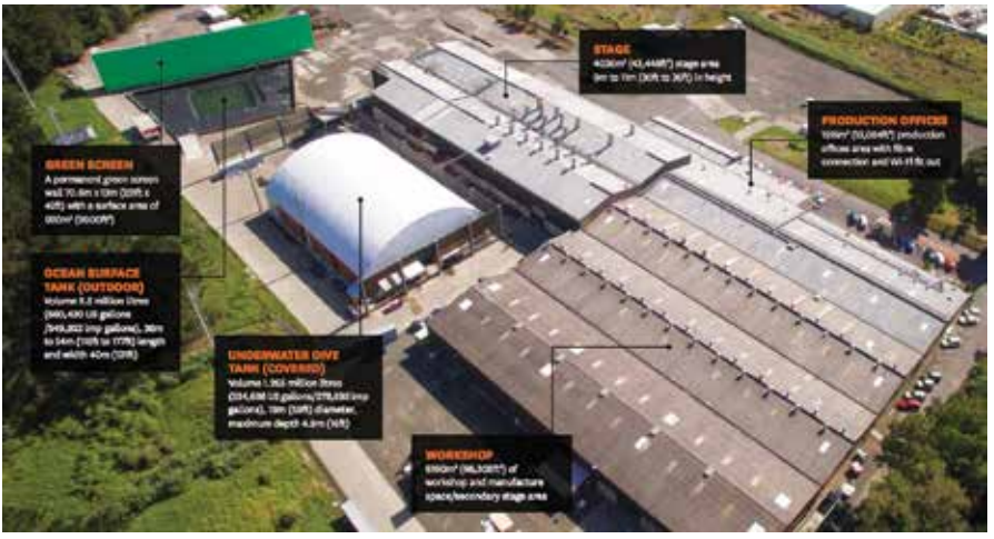
Kumeu Film Studios, 27 hectare site with and 1.267 million litre indoor and 2.5 million litre outdoor dive tank.