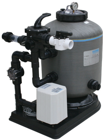
Engineered specifically for, natural pools, koi ponds and water gardens. Aquabiome provides mechanical and biological filtration in a single housing.