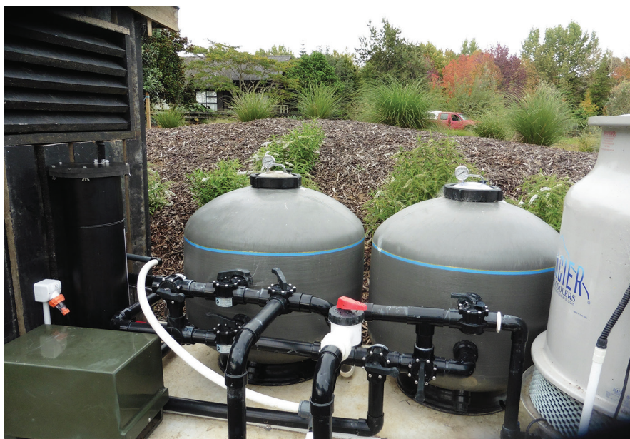
Biological filtration is the most effective method of removing toxins (ammonia) and breaking it down into nitrites and then into nitrates which provides food for aquatic plants.

Created by Gold Coast-based inventor Nick Briscoe in conjunction with international water treatment and swimming pool solutions manufacturer Waterco, Hydroxypure is a truly chlorine-free water treatment system. It's free of odours and taste, is soft and gentle on the skin – what's more, no shower is required after swimming.