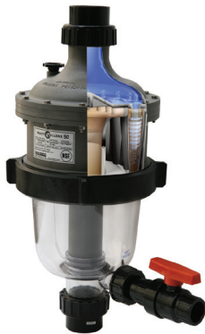
The MultiCyclone M16 is a pre-filtration device that works on the basis of centrifugal water filtration. There are no moving parts to wear and tear and no filter media to clean or replace.